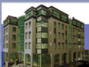
EEA Head office building

Economic Knowledge for Optimal Decision!