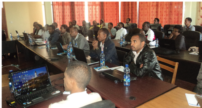
EEA Multi purpose Hall